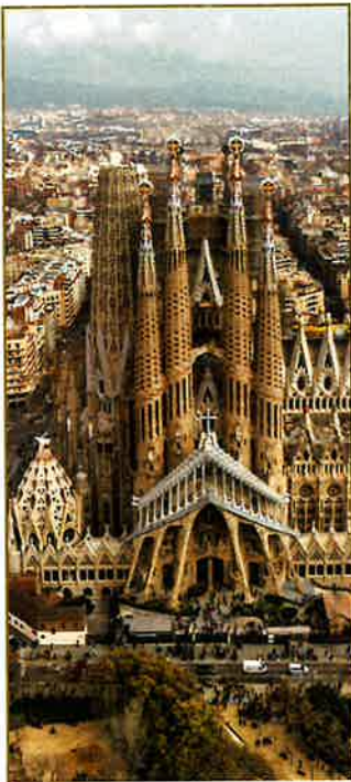
Recommended Shore Experiences